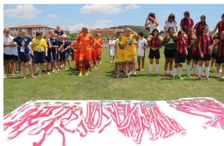
Team Medals "Up for Grabs" - 2014