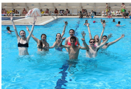
Fun Time after Competing - 2014