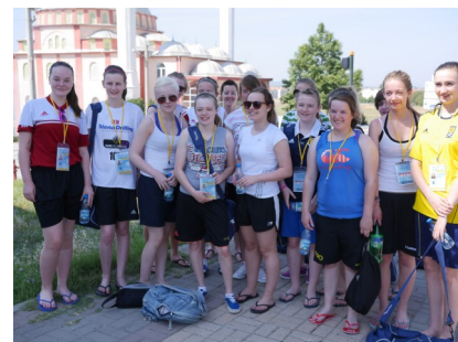
Girls Football Team - 2014

The Fife Olympiad Committee also organises the Glenrothes Road Running Festival. This year's event will be held on the 18th June at the Michael Woods Sports & Leisure Centre. This is a multi race event and includes 2 km, 4 km and 10 km races. All the profits are retained for the support of the participants in the following Youth Olympiad.